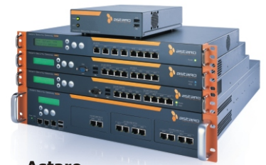
Astaro Hardware Appliances