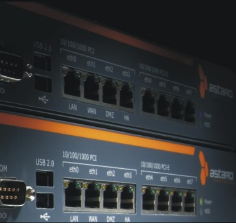
Astaro Security Gateway 320